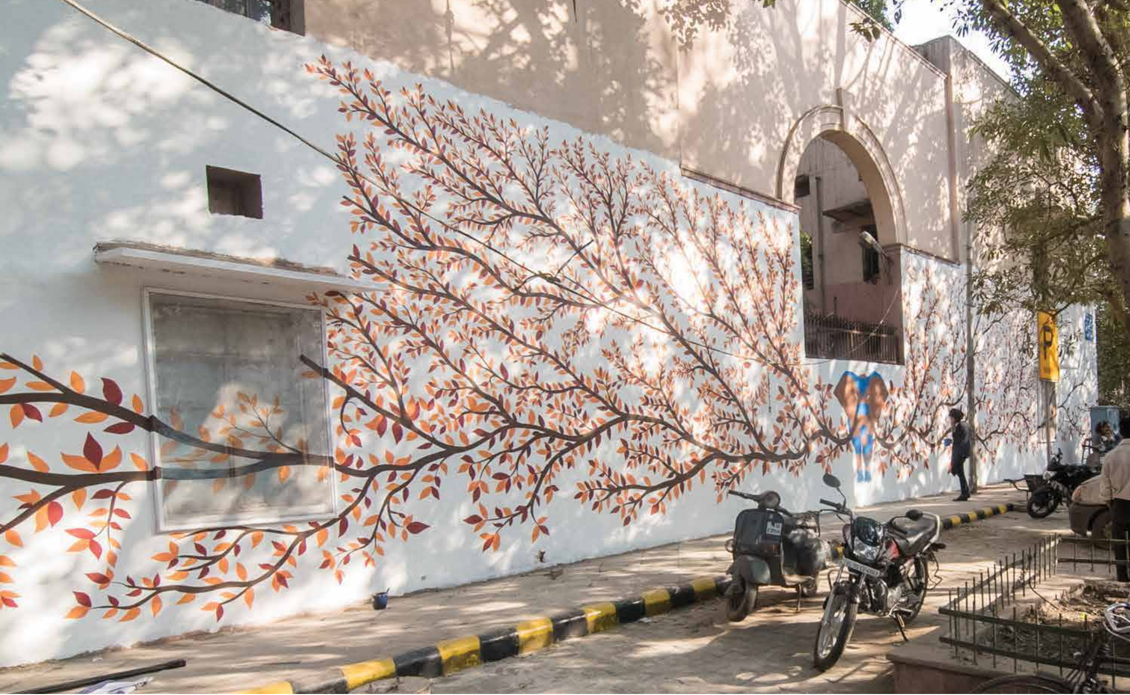
RAKESH - DELHI • INDIA