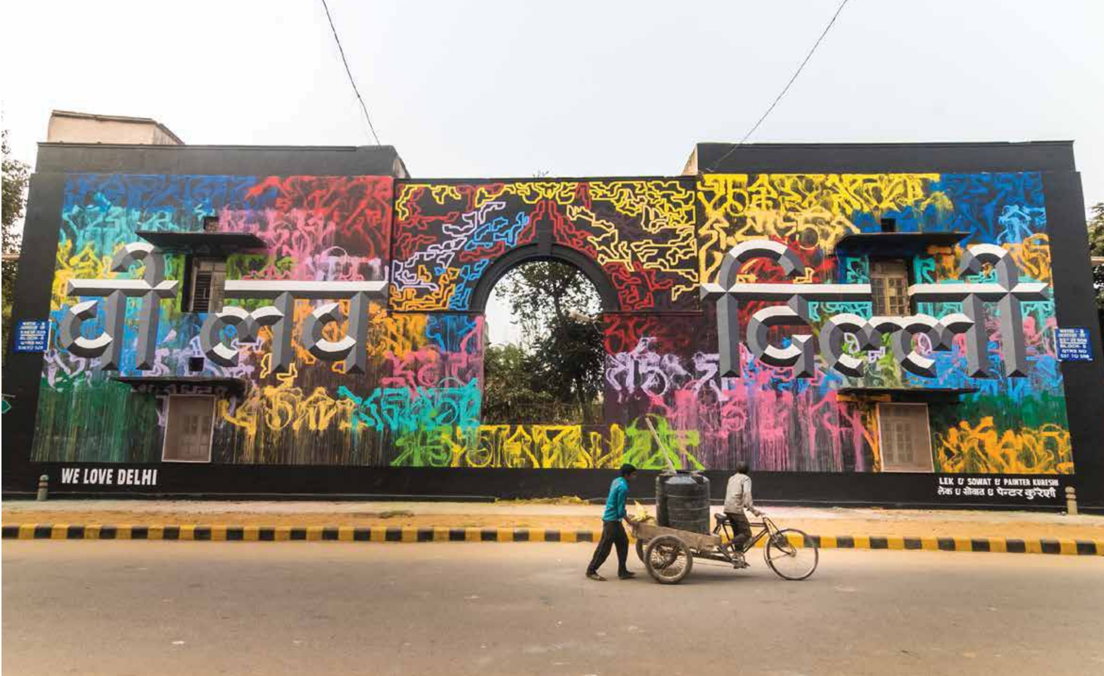
LEK & SOWAT WITH PAINTER KURESHI - FRANCE & DELHI • INDIA