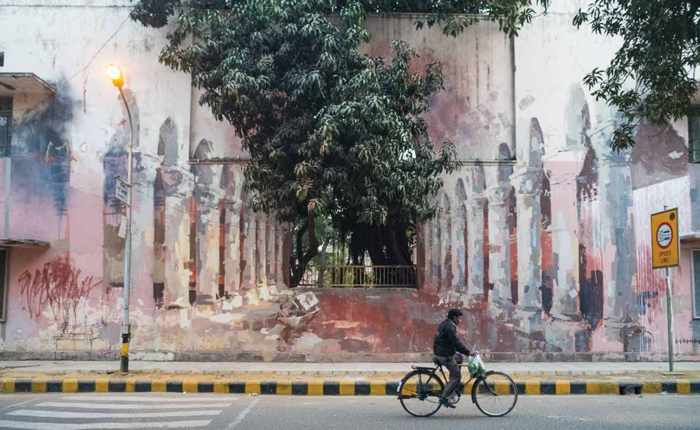
BORONDO - SPAIN