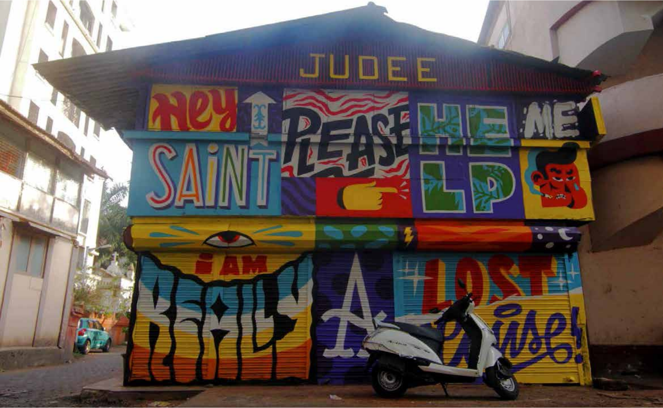
AKACORLEONE (PORTUGAL) • ST.JUDE BAKERY, BANDRA