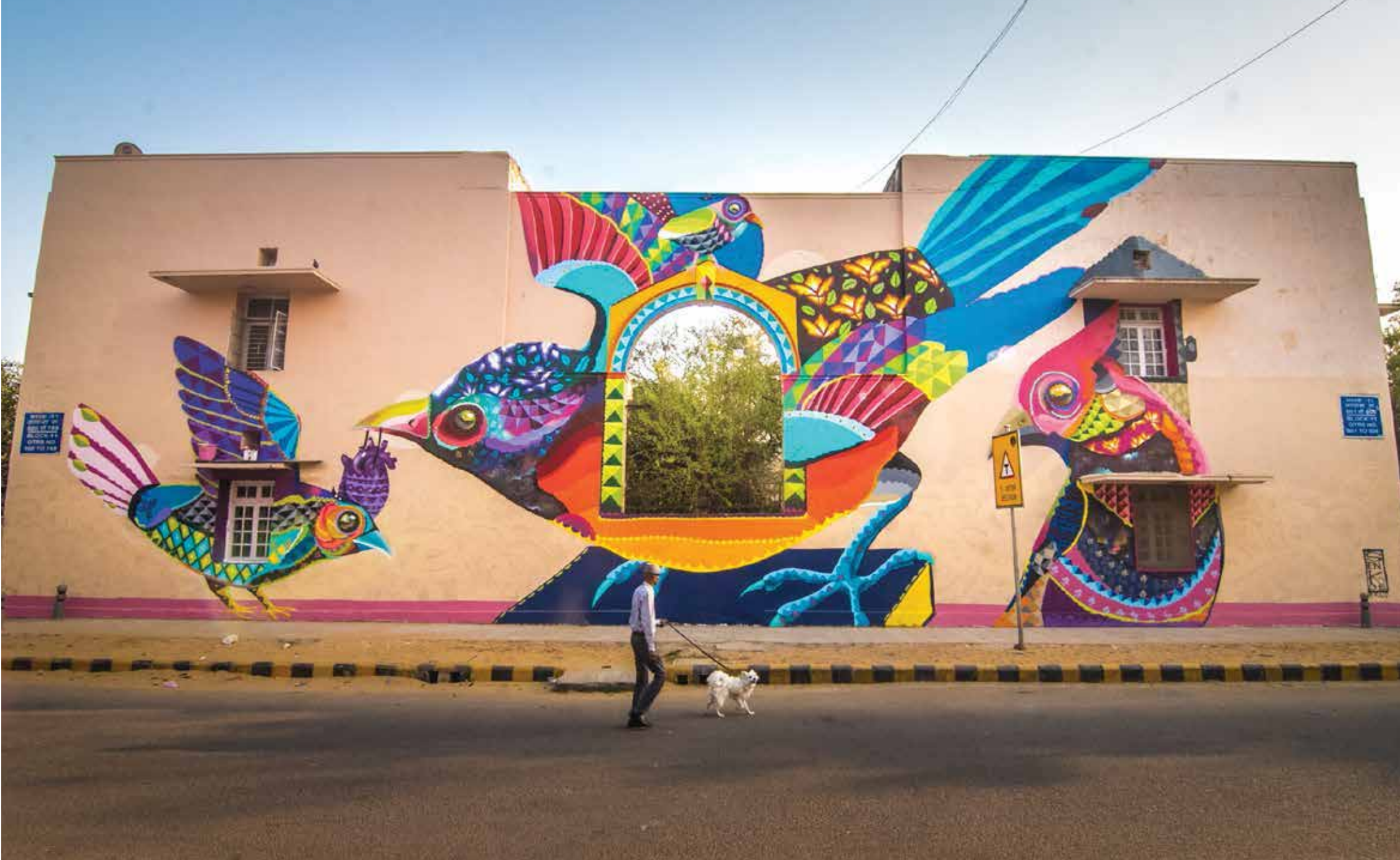
SENKOE - MEXICO