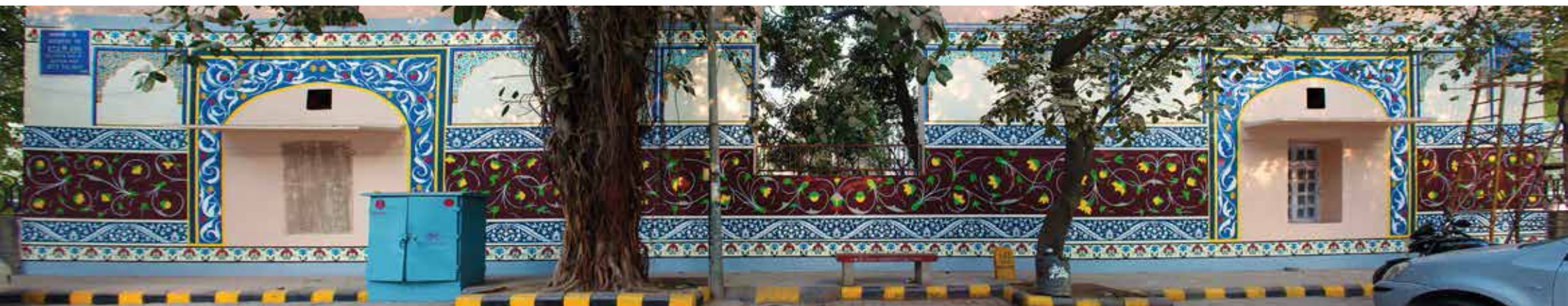
MAHENDRA - RAJASTHAN • INDIA