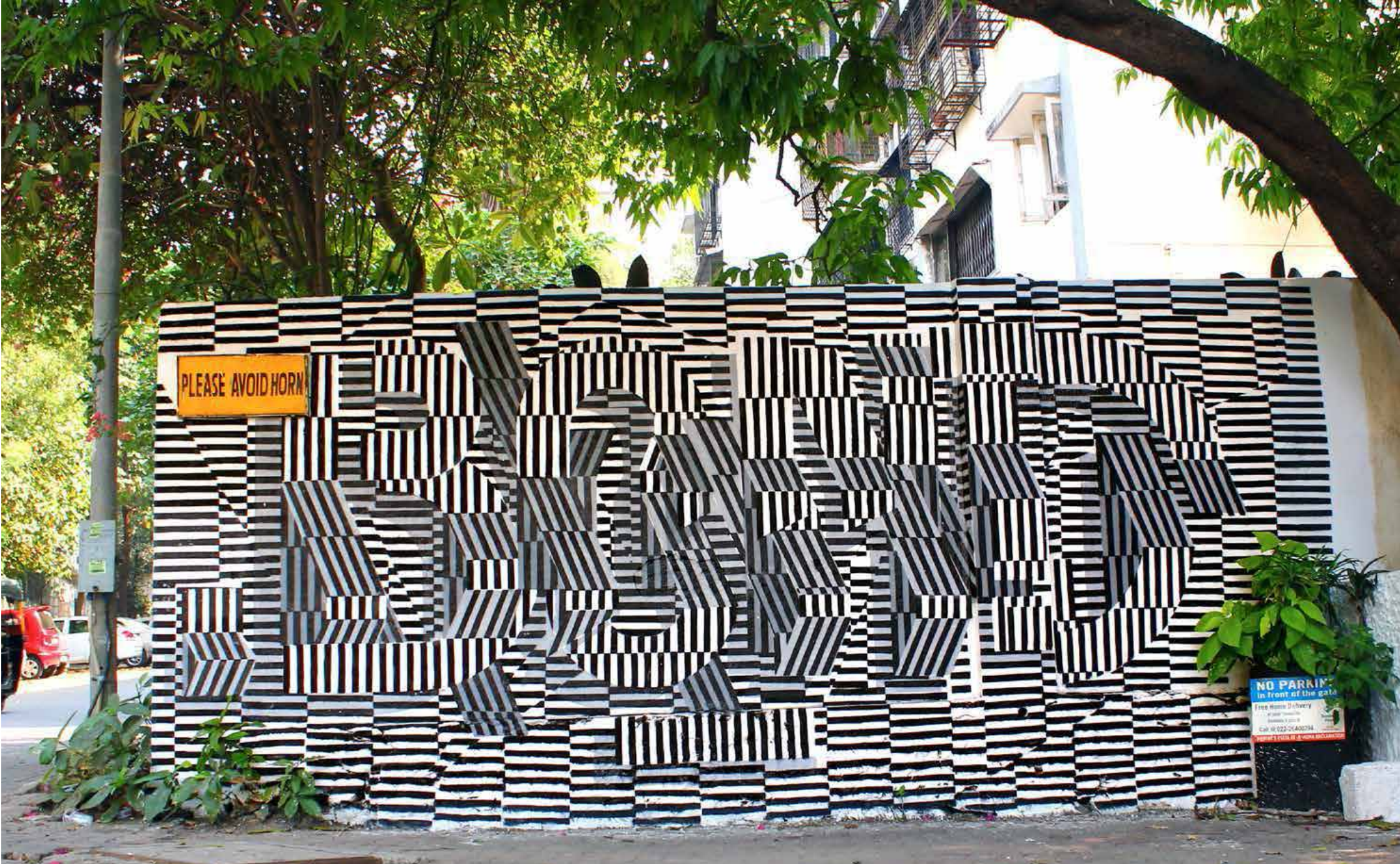
BOND (GERMANY) • PALI VILLAGE, BANDRA