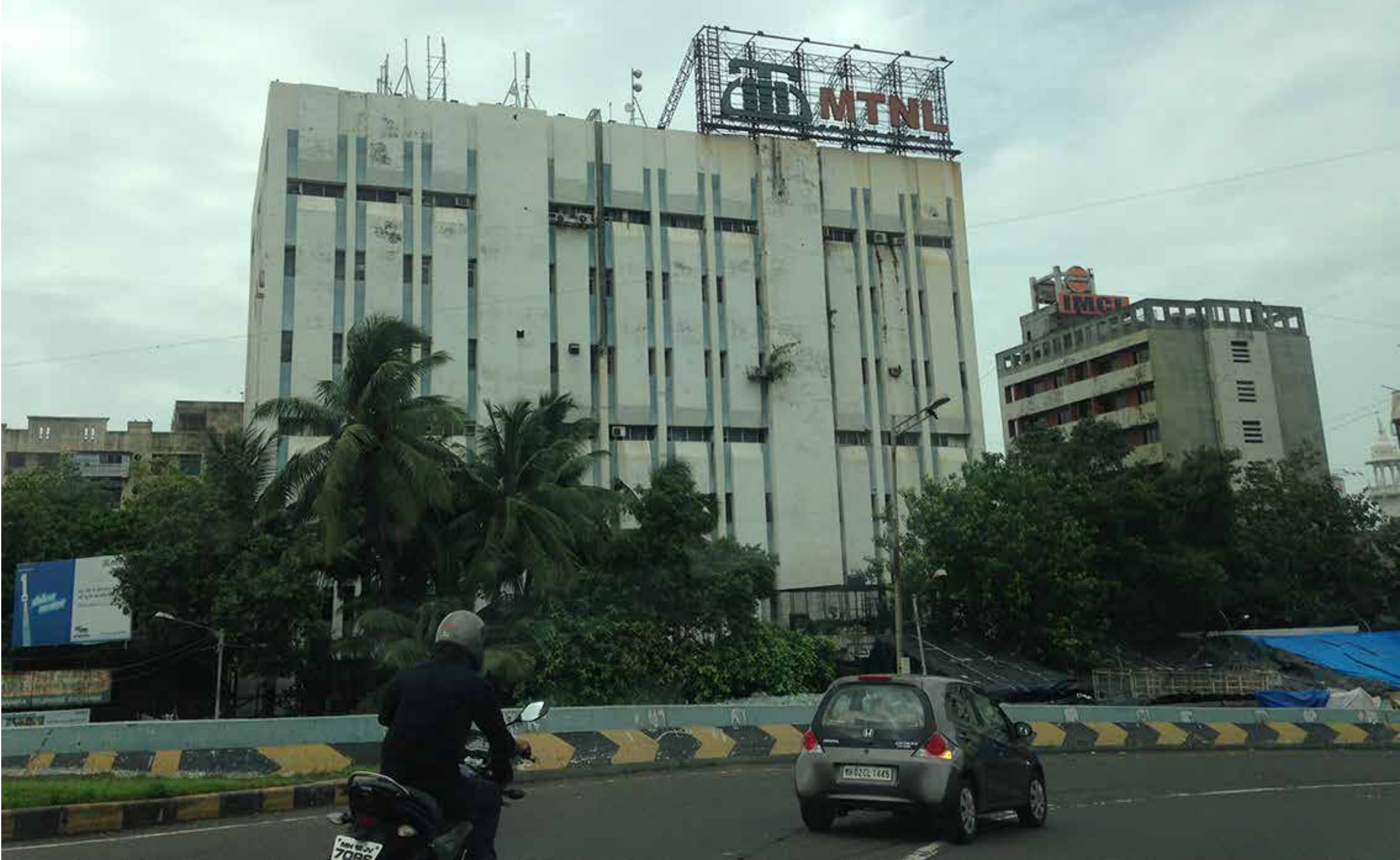
MTNL BUILDING (BEFORE) • BANDRA