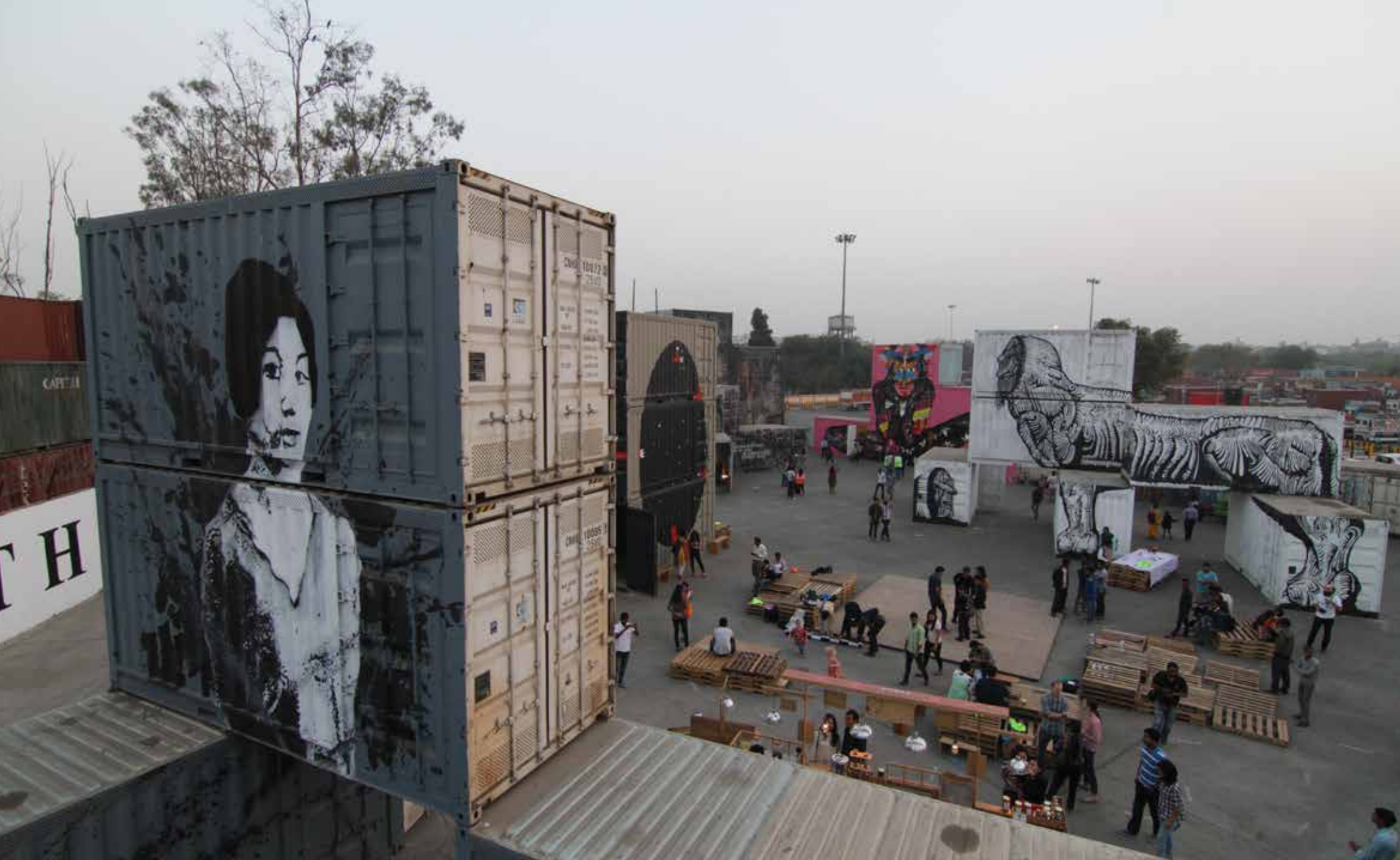
NAFIR - IRAN