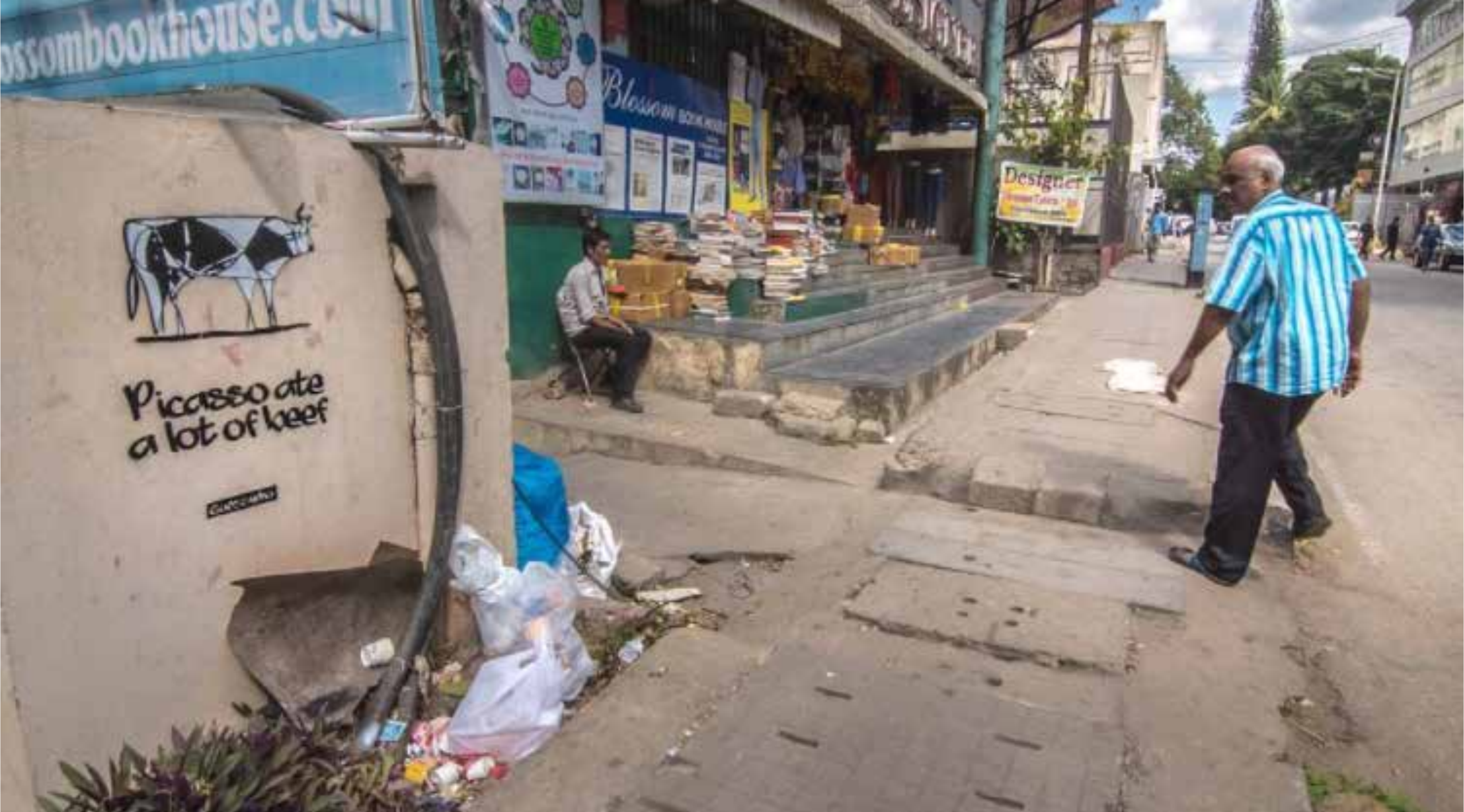
GUESSWHO - CHURCH STREET