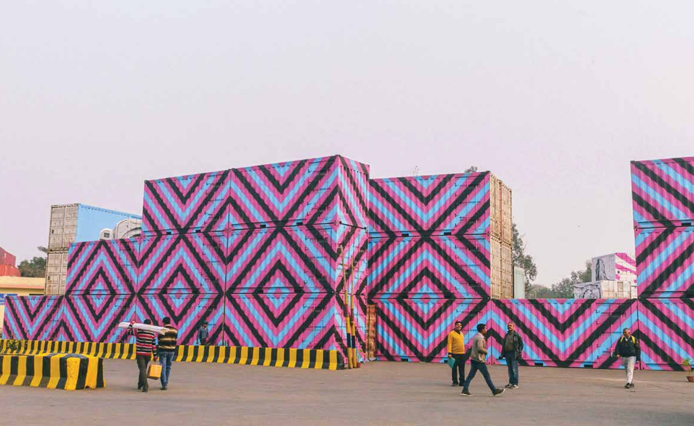
REKO RENNIE - AUSTRALIA