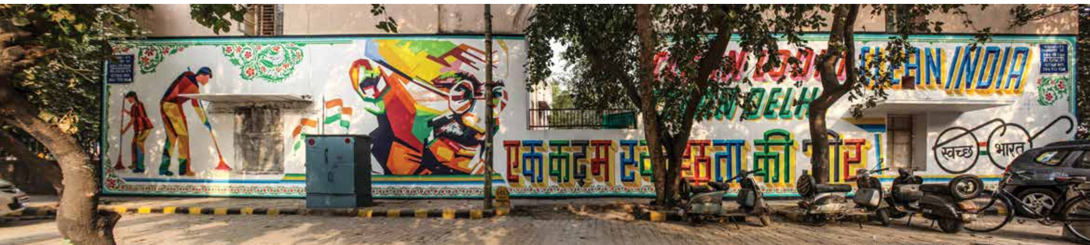
PAINTER KAFEEL & TEAM - DELHI • INDIA