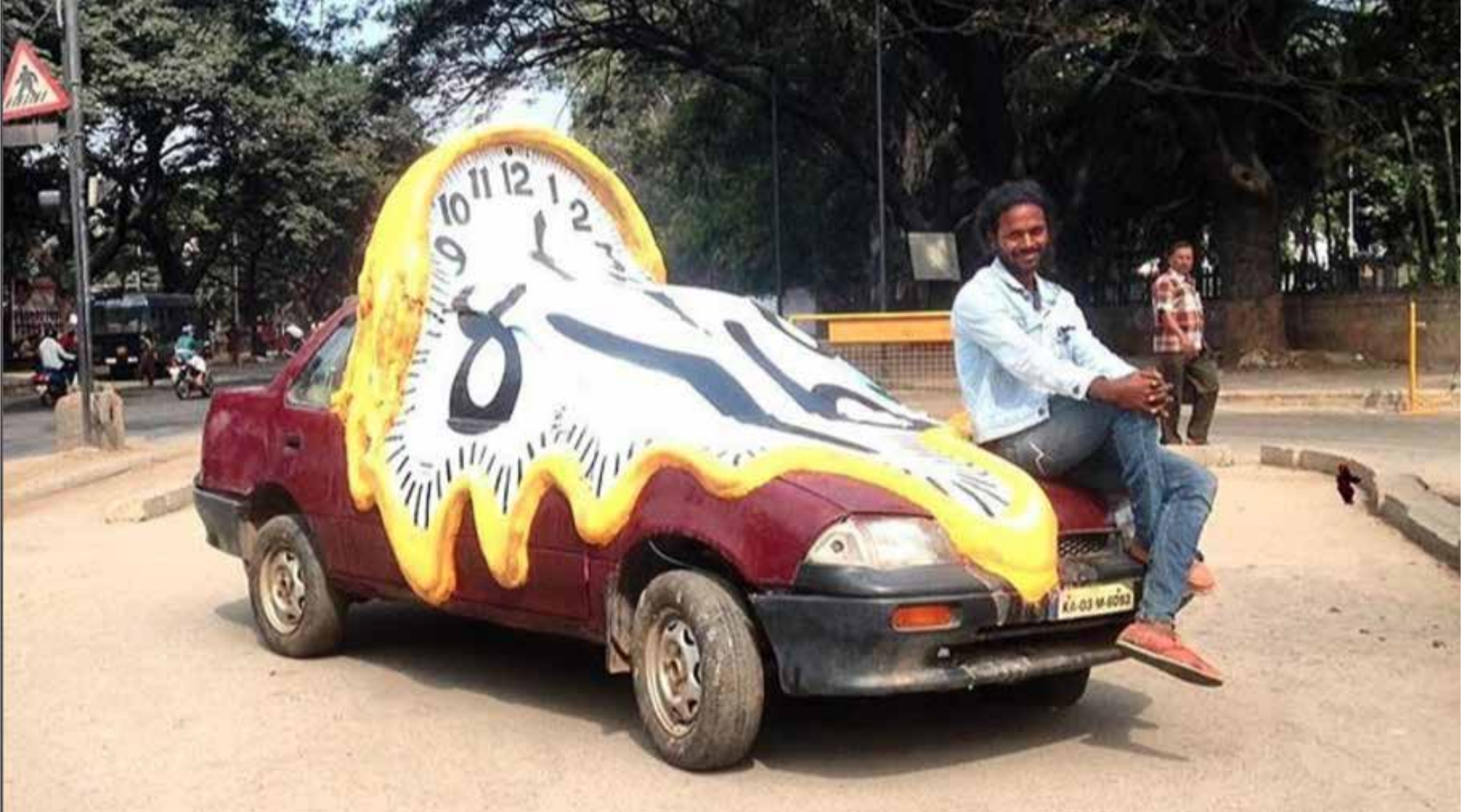
BAADAL - KR CIRCLE