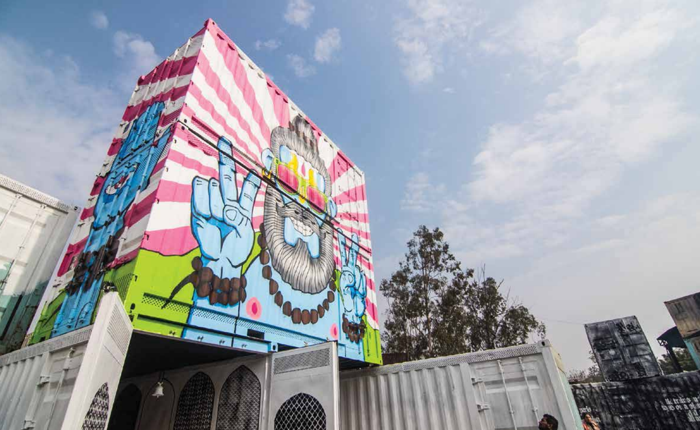
HARSH RAMAN - PUNE • INDIA