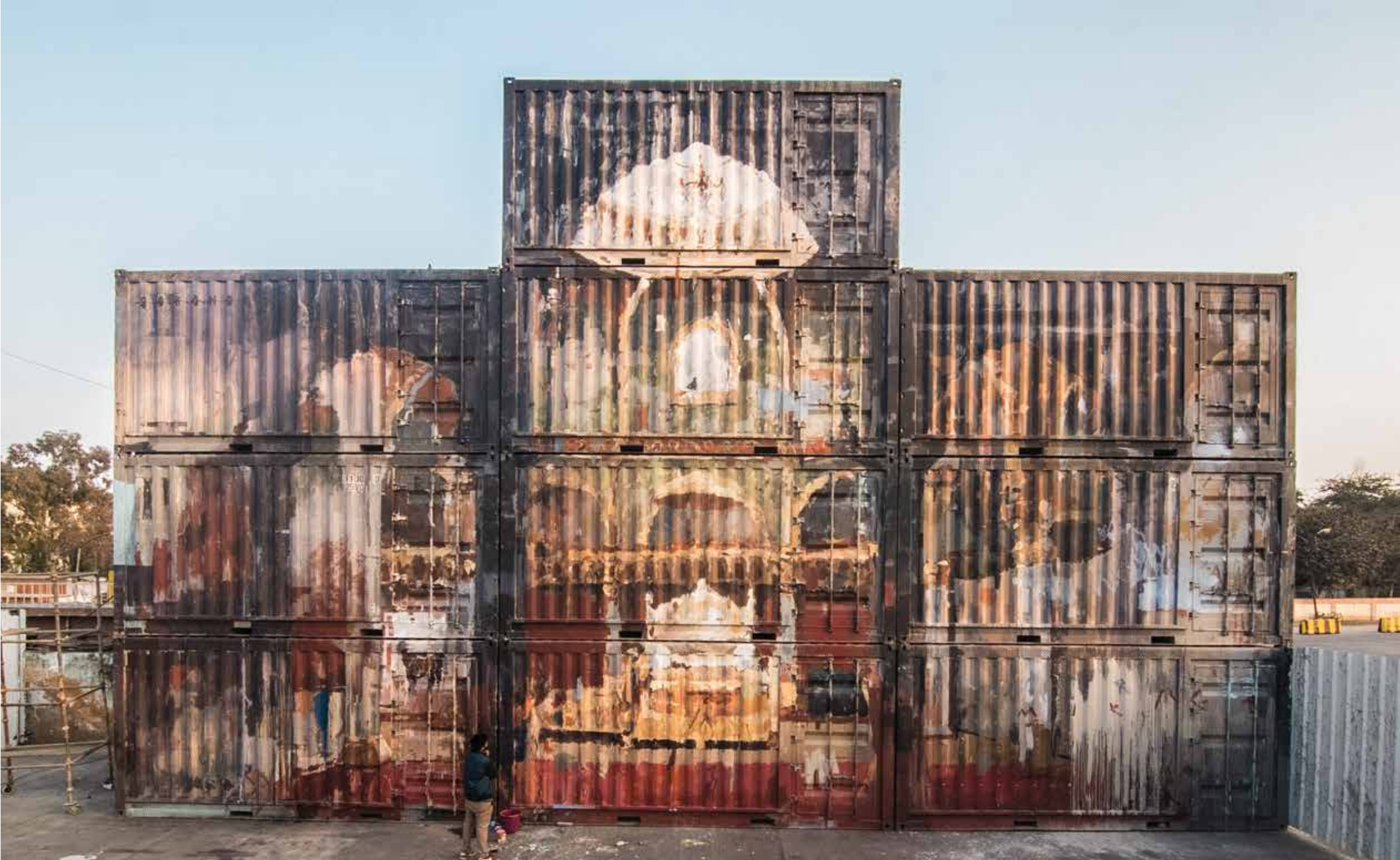
BORONDO - SPAIN