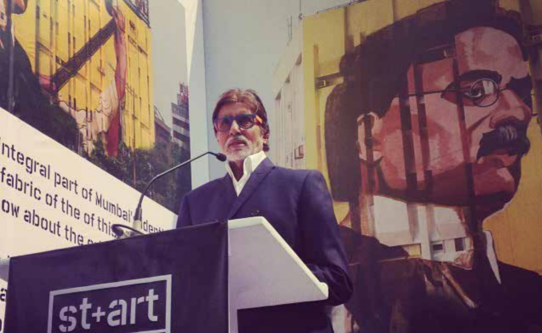
MR. AMITHAB BACHAN @ THE OPENING OF DADASAHEB PHALKE'S MURAL