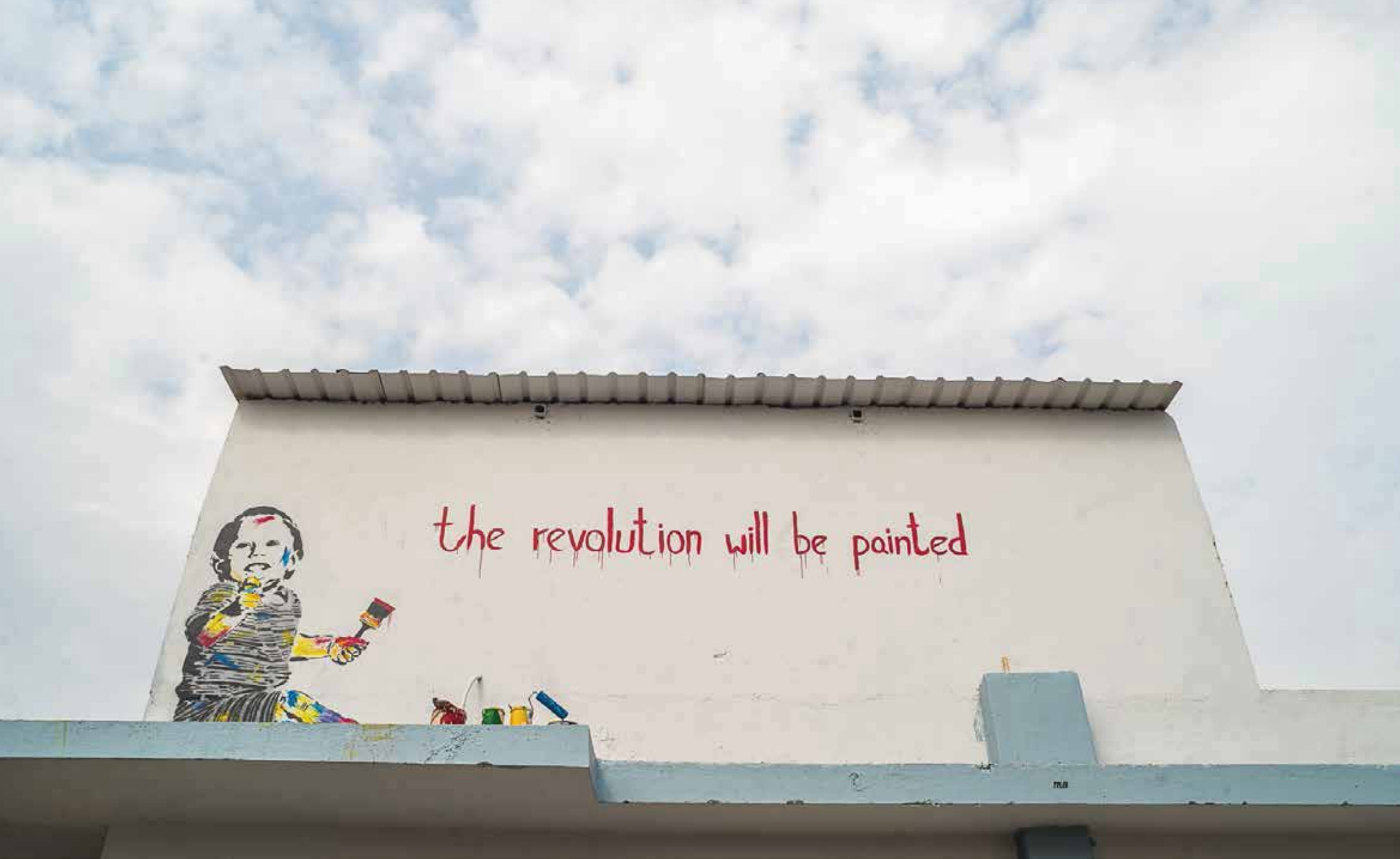
TYLER - MUMBAI • INDIA