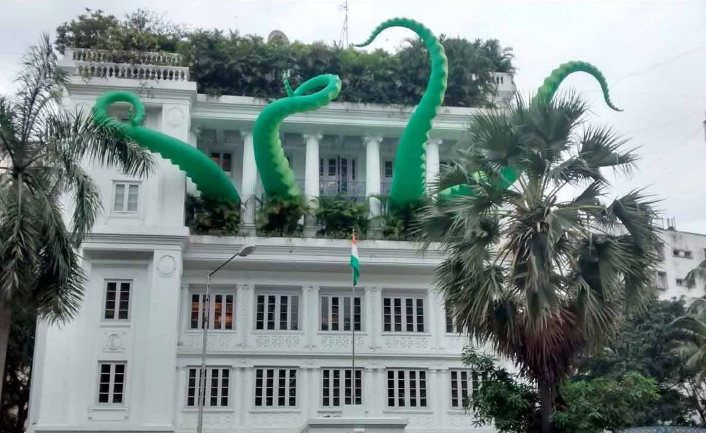
FILTHY LUKER (UK) • TENTACLE MONSTER INSTALLATION • PEDDER ROAD