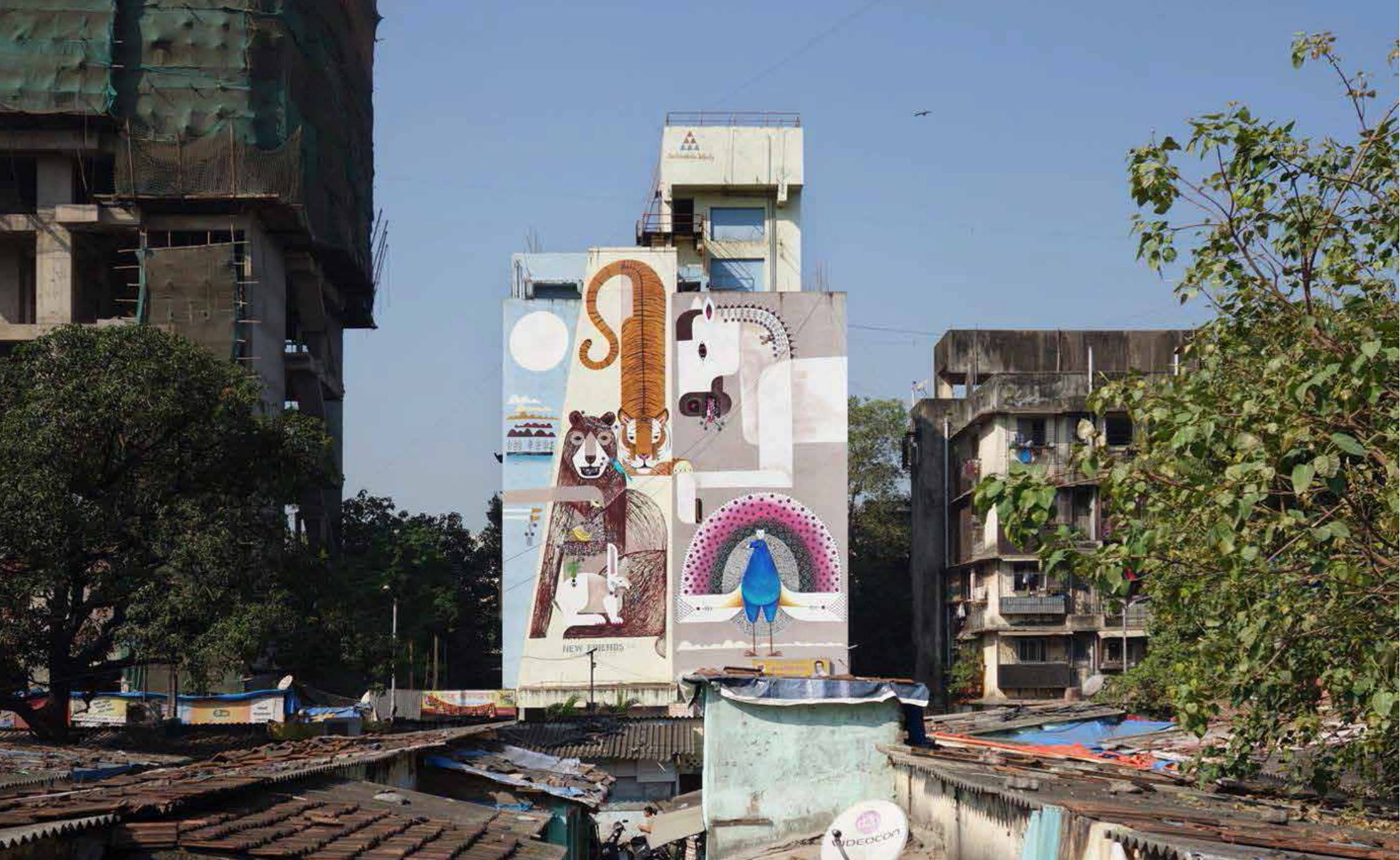
TIKA (SWITZERLAND) • NEW FRIENDS COLONY, BANDRA